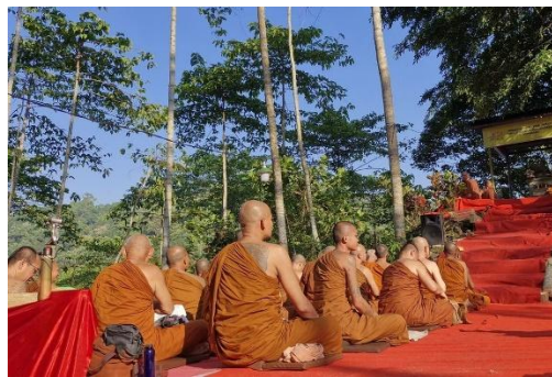
Figure 2. A series of releases of Thai Bhikku Thudong at Kassapa Hill, Curug Kedung Kudhu area, Pudukpayung

The visit of 43 Thai Thudong monks to the Kedung Kudhu waterfall area, as they embarked on a spiritual journey from Kassapa Hill at the Sima 2500 Buddha Jayanti Vihara in Puduk Payung, Semarang City, on Thursday (16/5/2024) morning towards Borobudur Temple in Magelang for the upcoming Vesak Day celebration on Thursday (23/5/2024), highlights the potential for increased tourist visits to the destination and underscores the importance of improving access facilities and tourist support amenities in the area, as emphasized by the research on the challenges of accessibility and amenities in developing the Curug Kedung Kudhu ecotourism destination, which becomes even more relevant in light of this recent development, calling for the prioritization of infrastructure enhancements, clear signage and information centers, and the development of essential facilities such as accommodations, restaurants, and souvenir shops, while also emphasizing the critical role of community participation and multi-stakeholder collaboration in ensuring equitable distribution of tourism benefits and preserving the area's cultural and environmental integrity, ultimately positioning Curug Kedung Kudhu as a sustainable and inclusive ecotourism destination that offers a unique blend of spiritual, cultural, and natural experiences for visitors while providing economic benefits to the local community (Fauziyah et al, 2024).