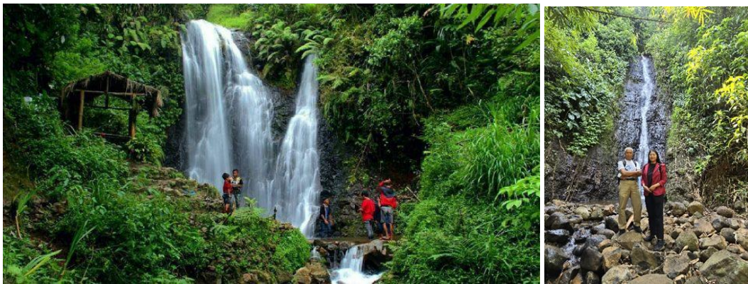
Figure 1. The author and the Kedung Kudhu management team at the Curug Kedung Kudhu Waterfall.

Based on data from the official website of Pudukpayung Village, the population in this area reaches 25,966 people, consisting of 13,098 males and 12,868 females, spread across 8,178 households. The majority of the population follows Islam (21,072 people), followed by Christianity (1,706 people), Catholicism (1,643 people), Hinduism (31 people), Buddhism (28 people), Confucianism (3 people), and belief in God (15 people). The population distribution by age group shows that there are 1,606 people in the 0-4 age group, 1,902 people in the 5-9 age group, 2,013 people in the 10-14 age group, and so on, with 245 people in the age group of 75 and above (disbudpar, 2024).