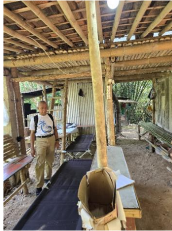
Figure 3. Rest Facilities for Visitors

The development of tourism amenities at Curug Kedung Kudhu must carefully consider both the environmental carrying capacity and the socio-cultural dynamics of the local community. As emphasized by one participant: